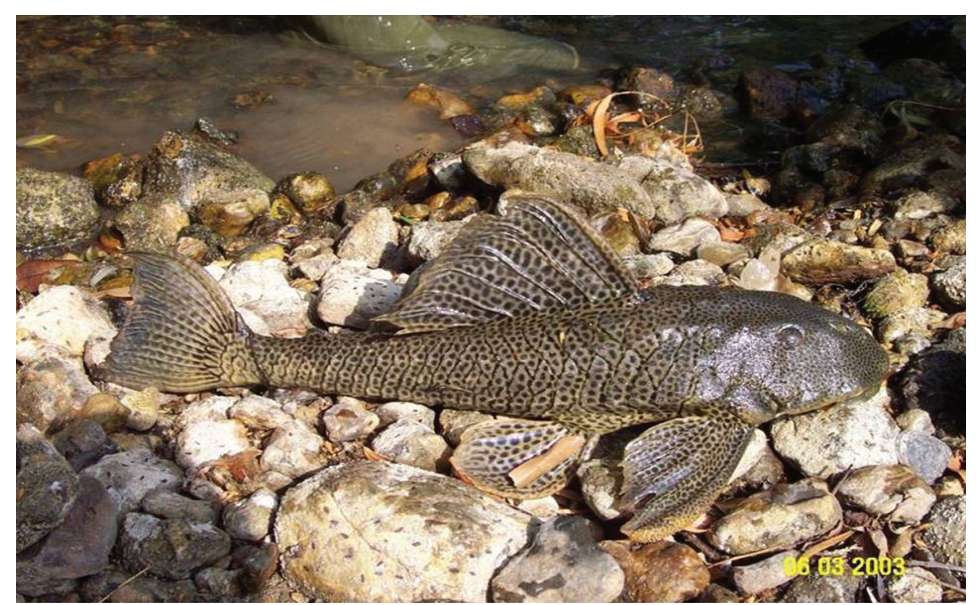
Figure 1. Armadillo del rio ( Hypostomus sp.) from the San Antonio River, Texas. Note dorsal fin with single spine and seven soft rays. Appearance is consistent with that of Hypostomus niceforoi.

In addition to their remarkable boney armor, other adaptations of suckermouth catfishes enable them to survive environmental extremes, food limitations, and predation. A large, vascularized stomach functions as a lung and as a swim bladder allowing fish to breathe