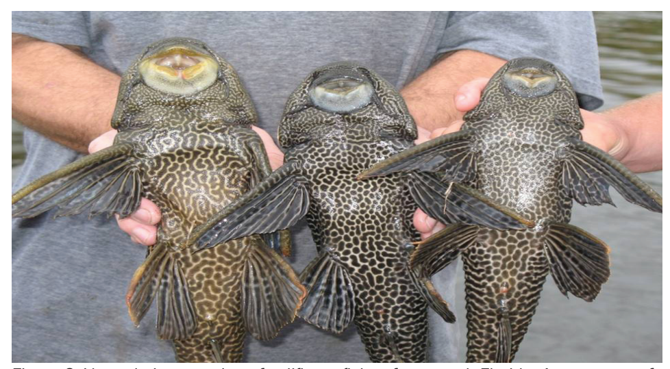
Figure 3. Ventral pigmentation of sailfin catfishes from south Florida. Appearance of fish at left is consistent with that of P. disjunctivus , appearance of fish at center and right with that of P. pardalis or hybrids.