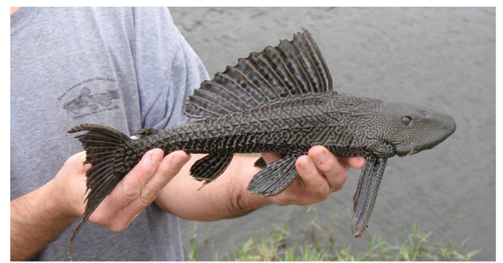
Figure 2. Sailfin catfish ( Pterygoplichthys sp.) from southern Florida. Note dorsal fin with single spine and 12 soft rays.