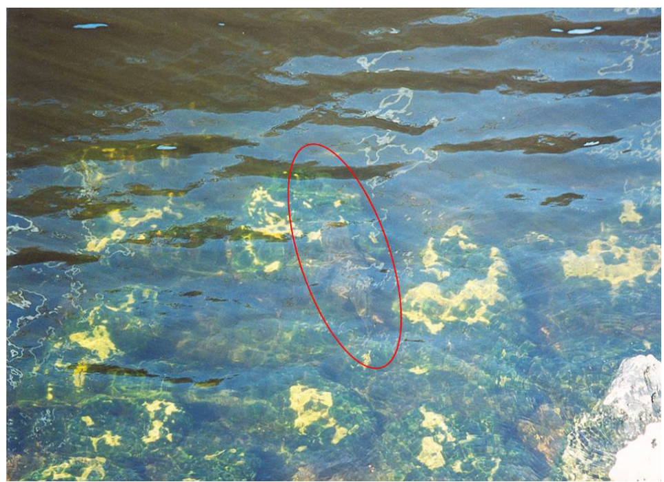
Figure 4. Submersed boulders in the Caloosahatchie River, Florida. White bands are grazing scars denuded of algae by suckermouth catfishes. A sailfin catfish ( Pterygo-plichthys sp.) is present in the center of the picture (within red circle).

Suckermouth catfishes are believed to compete for food with smaller fish, disturb nest sites excavated in algae, and ingest eggs. In Texas, they have been implicated in declines of algae-eating central stonerollers ( Campostoma anomalum ) in the San Antonio River (Hubbs et al. 1978), and are