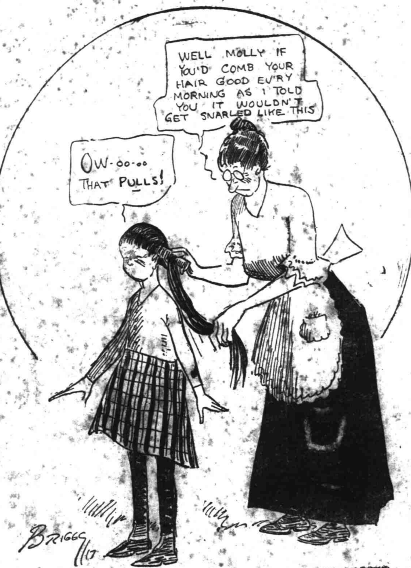
Copyrighted 1917 by The Tribune Assoc. (New York Tribune)