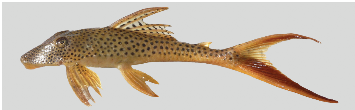
Fig. 2. Lateral view of Aphanotorulus rubrocauda , MNRJ 37551, paratype, 118.6 mm SL, Brazil, Mato Grosso State, Aripuanã Municipality, rio Aripuanã basin, 500 meters downstream of the rapids of Dardanelos waterfalls.