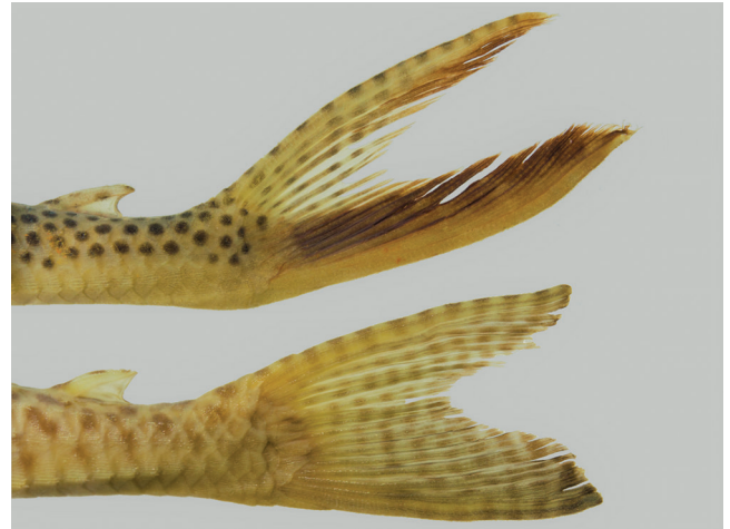
Fig. 5. Lateral view of caudal fin illustrating the coloration: Upper: Aphanotorulus rubrocauda MNRJ 39824, paratype, 132.2 mm SL. Lower: Aphanotorulus emarginatus INPA 36634, 147.3 mm SL.

The new species has a distinct coloration from all congeners. In Aphanotorulus ammophilus , A. emarginatus , A. gomesi , A. horridus , A. phrixosoma , and A. unicolor the lower and upper lobe of the caudal fin are completely covered with several series of transversely aligned conspicuous dark spots on the membrane and on the rays (Fig. 5). Other characteristic that distinguishes A. rubrocauda from the others species of Aphanotorulus is the absence of dark spots on the pelvic fin, although these are present in some specimens.