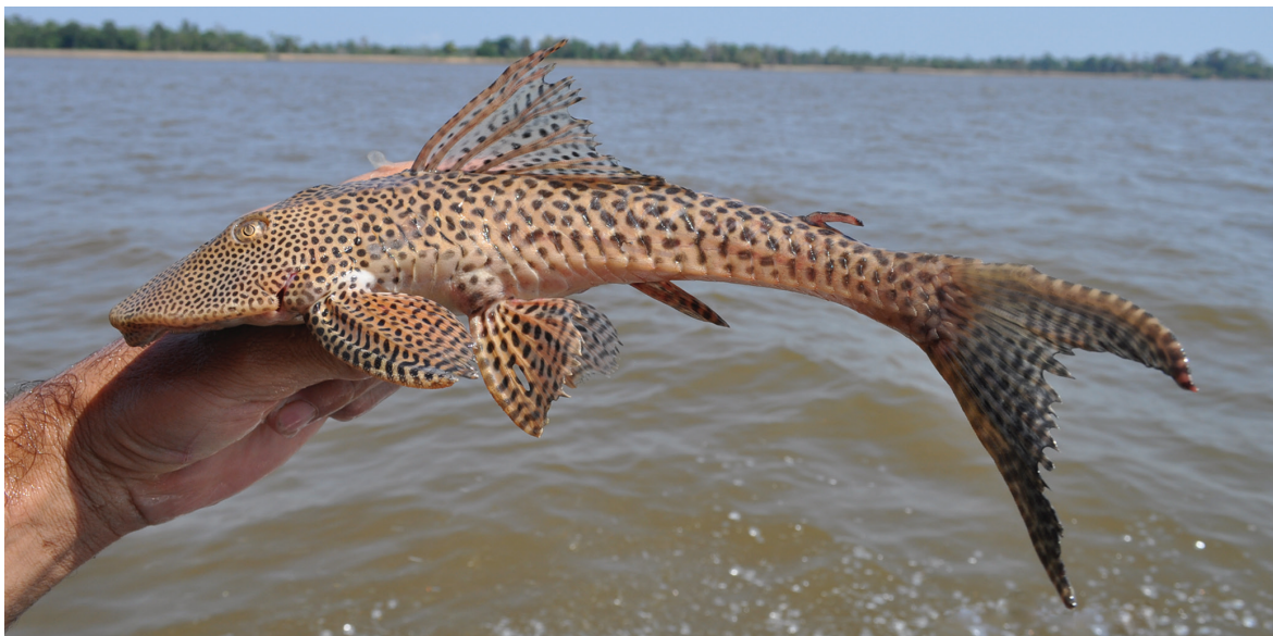
Fig. 3. Lateral view of Aphanotorulus emarginatus , NUP 17748, 257.3 mm SL, Brazil, Amazonas State, Parintins Municipality, Paraná do Ramos, rio Amazon basin.

Diagnosis. Aphanotorulus rubrocauda can be distinguished from all other species of Aphanotorulus by its color pattern: having a uniformly red colored lower caudal-fin lobe ( vs. lower lobe of caudal fin with dark spots on creamy colored background), by the absence of dark spots on the posterior half of mid-ventral lateral plate series ( vs. presence of dark spots in all lateral plate series). Additionally, Aphanotorulus rubrocauda is distinguished from congeners by having more premaxillary teeth (32-65 per ramus, mean = 45; vs. 15-34, mean = 24) and dentary teeth (30-63 per ramus, mean = 44; vs. 14-34, mean = 25). Aphanotorulus rubrocauda further differs from A. emarginatus by having small round dark spots ( vs. dark large and elongated spots) (Fig. 3).