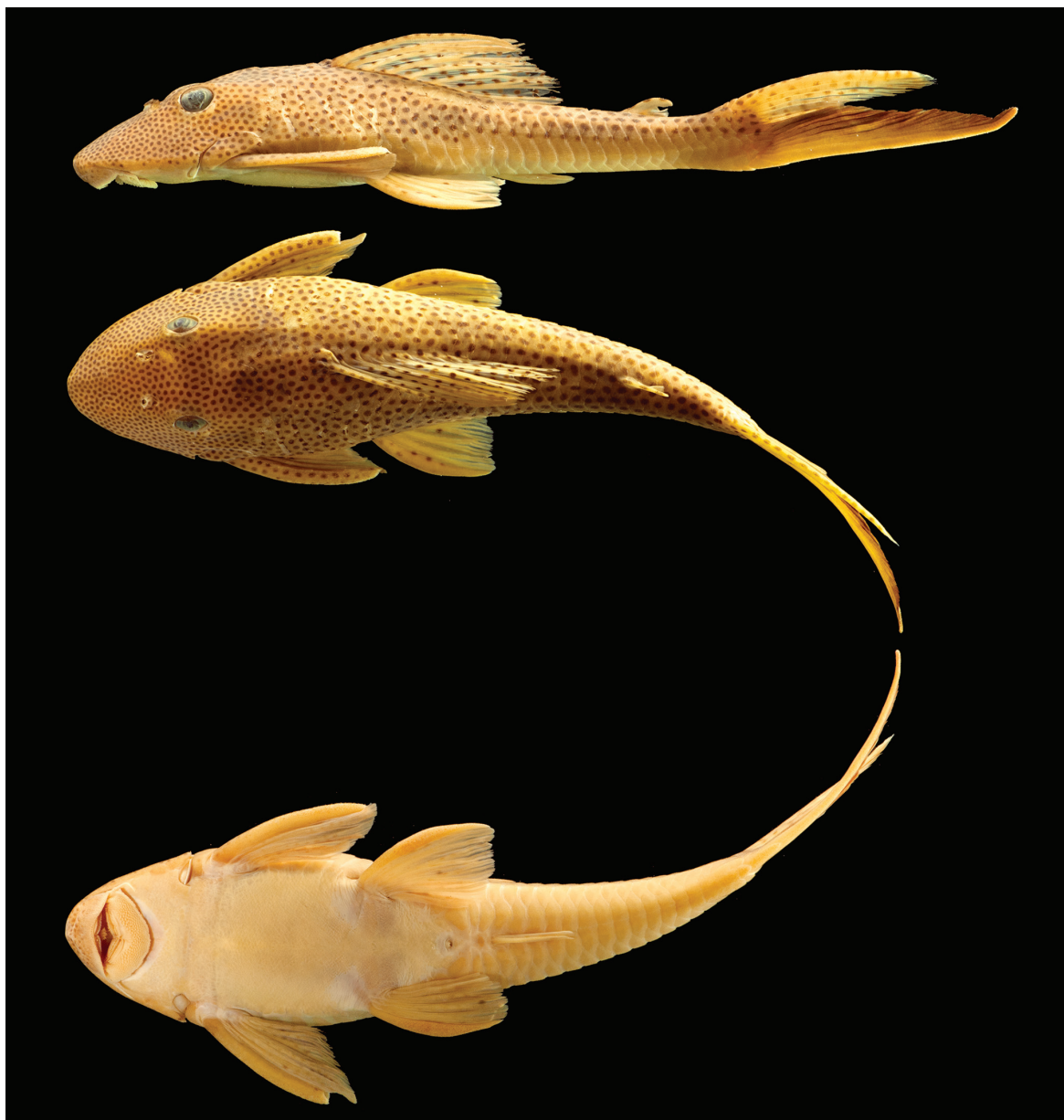
Fig. 1. Holotype of Aphanotorulus rubrocauda , INPA 33666, 150.5 mm SL, Brazil, Amazonas State, Apuí Municipality, Resex do Guariba, rio Aripuanã drainage, tributary of the rio Madeira basin, in lateral, dorsal, and ventral views.