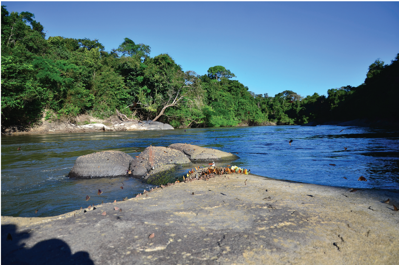
Fig. 6. Type locality of Aphanotorulus rubrocauda , Brazil, Amazonas State, Apuí Municipality, boulders on rapids 40 minutes above of the Comil farm, rio Madeirinha, rio Aripuanã basin.