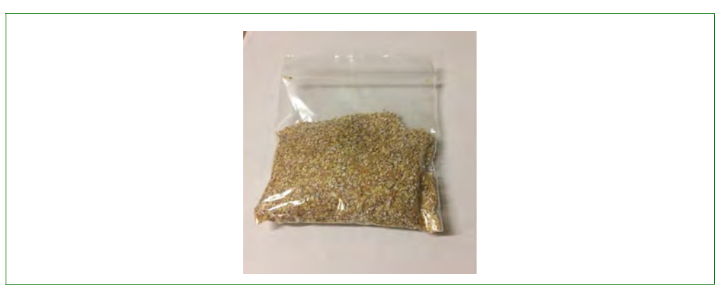
Figure 2-3 Organic Wheat Germ