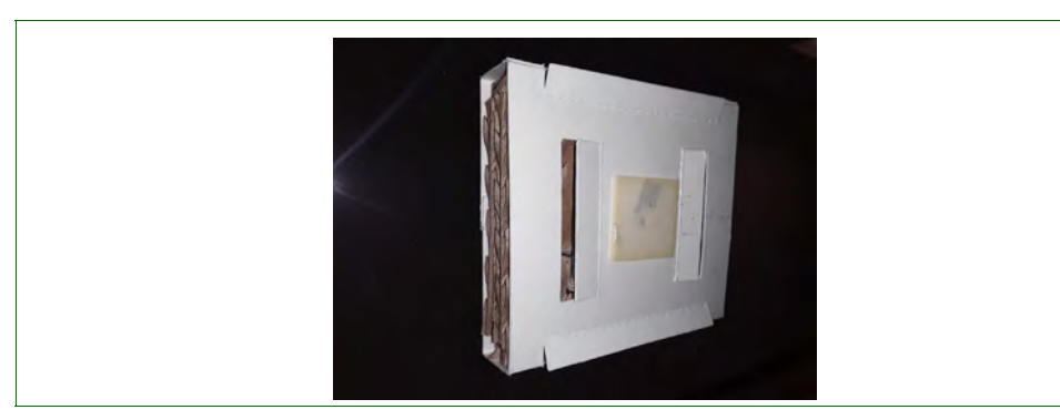
Figure 2-7 Wall Trap with Back Entry Tabs Opened Correctly

Be aware that the trap adhesive or tape (if used) may remove some paint from walls when the trap or tape is removed. Let the facility know this. You may need to choose a less prominent location.