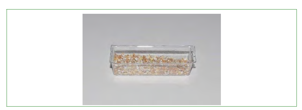
Figure 2-4 Plastic Collection Tray with Wheat Germ