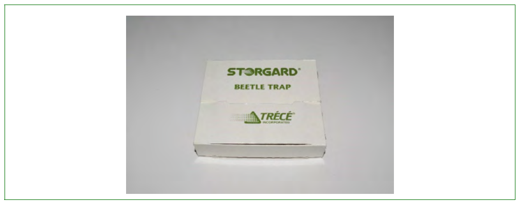
Figure 2-1 Khapra Beetle Wall-Mounted Trap

Fit the decoy aerial trap with one of the khapra beetle lures and hang it high in the open head space of the building. Use one aerial trap for every five to six khapra beetle wall-mounted traps.