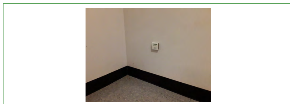
Figure 2-6 Correct Placement of Khapra Beetle Trap

Follow the instructions from the manufacturer that are included with the trap kit to assemble the traps. Use a permanent marker to label each trap with a unique identification number, for instance County Code-Facility Code-Trap Number. Use the wall mount trap inside and outside structures. Place traps around the inside of exterior walls and along interior walls of structures under investigation (Figure 2-6). Pay special attention to cracks in the walls and walls made of porous materials like cement blocks. Cracks may serve as pathways for insect movement. If possible, place a trap over a wall crack if one is found.