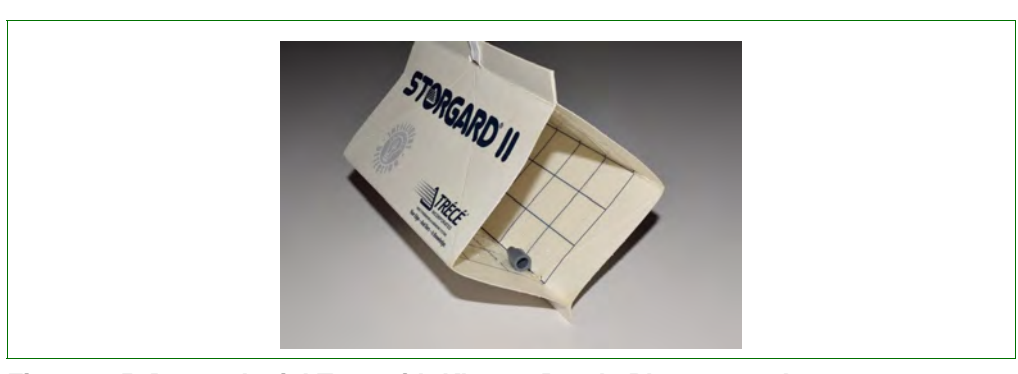
Figure 2-5 Decoy Aerial Trap with Khapra Beetle Pheromone Lure