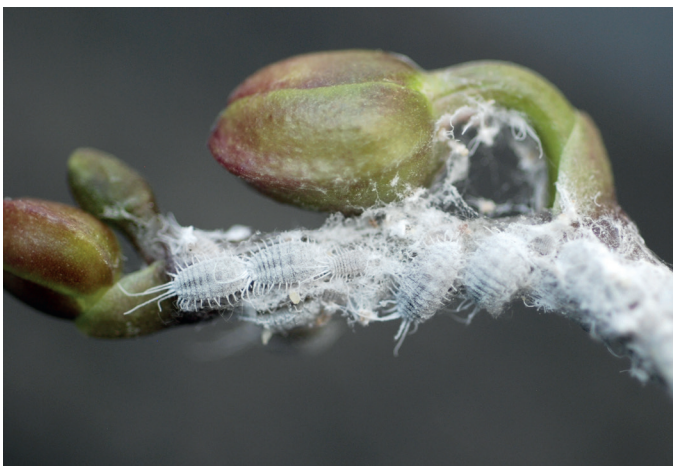
longtailed mealybug ( Pseudococcus longispinus )