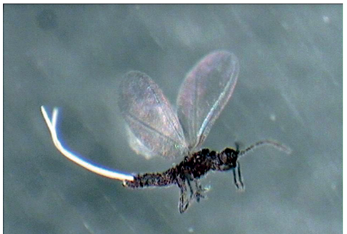
longtailed mealybug ( Pseudococcus longispinus ) with hyphae