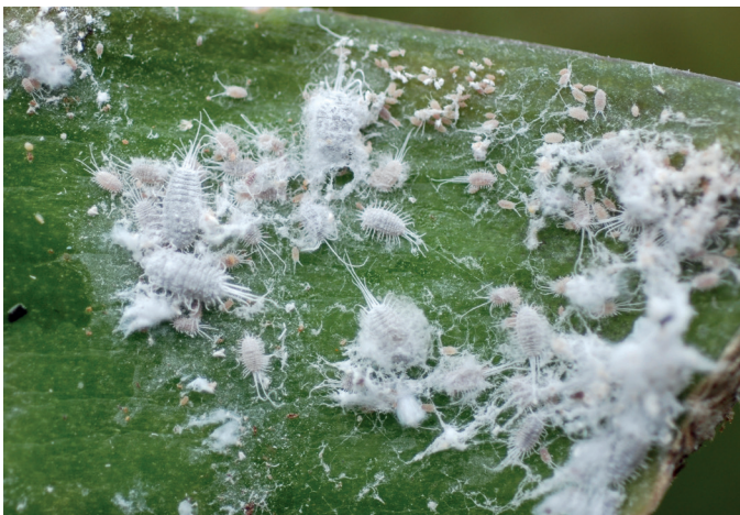
longtailed mealybug ( Pseudococcus longispinus )