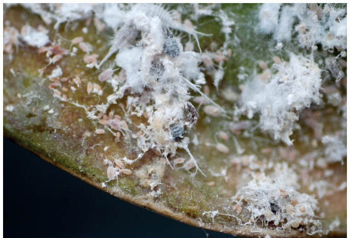
longtailed mealybug ( Pseudococcus longispinus )