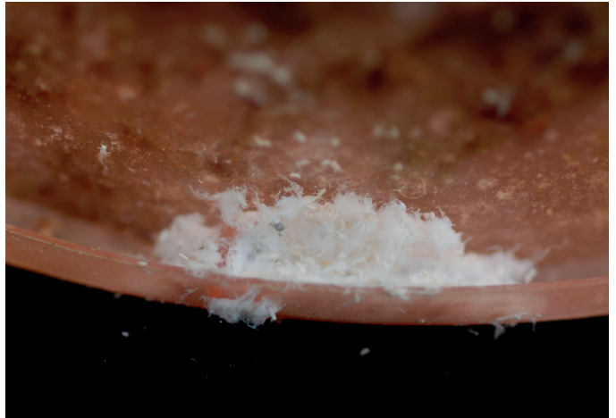
longtailed mealybug ( Pseudococcus longispinus ) below pot