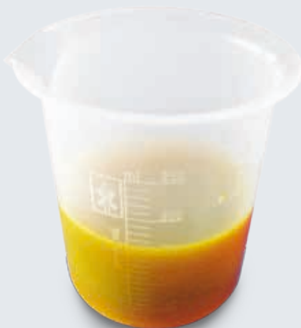
PAG and PAO Oil 68 mixed